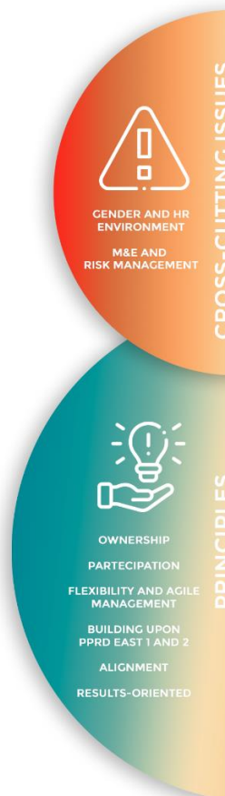
Exhibit 1: Programme Implementation Model

WP H RISK MANAGEMENT CAPACITIES - NRA (methodology, implementation) - DLD (methodology, implementation) - Using NRA and DLD in emergency planning - Introducing multirisk dimensions with focus on health issues (pandemic) - Risk assessment capability assessment